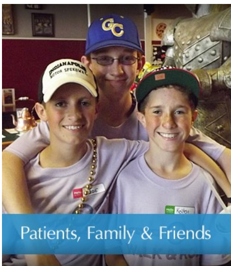
Patients, Family & Friends