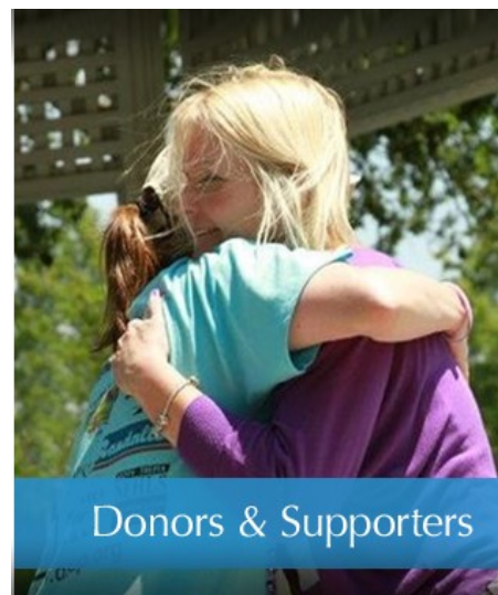
Donors & Supporters